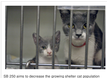
SB 250 aims to decrease the growing shelter cat population